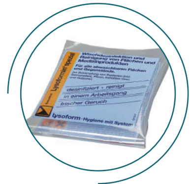
CE registered disinfectants – Lysoform™ – that qualify under the SFDA